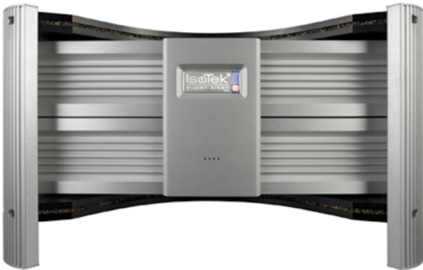
Above: IsoTek Super Titan power conditioning unit