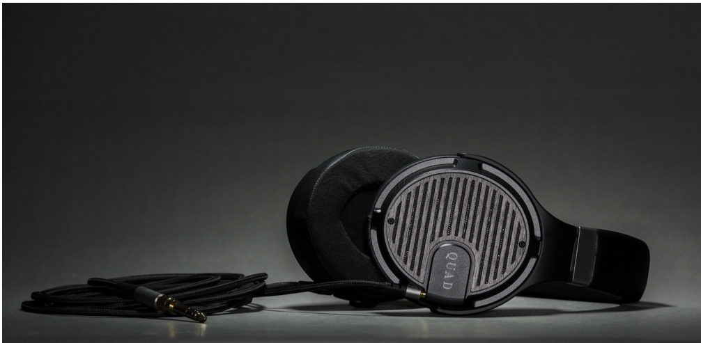
Above: Quad ERA-1 headphones