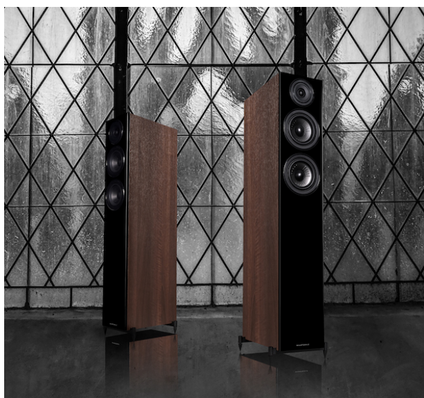
Left Wharfedale Diamond 12.4 floorstanding speakers in walnut finish