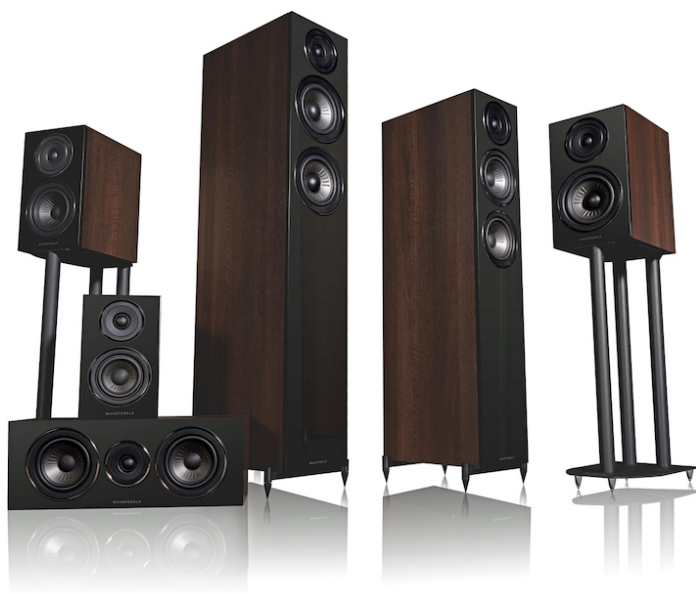
Above Wharfedale Diamond 12 Series speakers in walnut finish