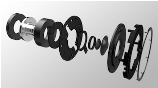
Left Diamond 12 treble driver assembly, featuring woven polyester film dome

the coil is higher than a standard laminated steel or ferrite core inductor, the magnetic structure of the mid/bass driver has been modified to compensate, resulting in fast, clean bass with no distortion from the inductor.