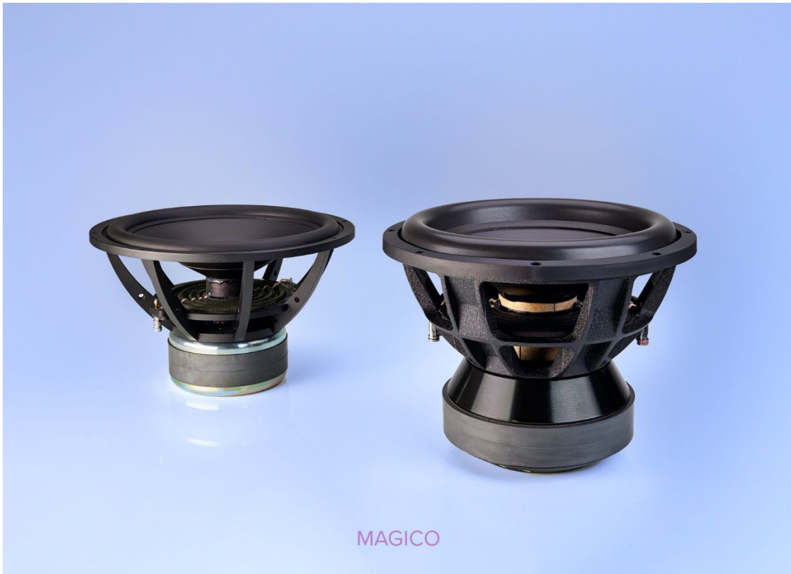
QSUB15 driver (left) and the new TITAN 15 driver (right).

The newly developed 15-inch driver in the TITAN 15 is optimized to deliver maximum output levels (136 dB) while minimizing music related distortions at 20Hz (>1% THD). The mechanics, electromagnetic and thermal behavior of the driver are optimized without compromise to ensure extremely high-level performance. The incredibly stiff aluminum cone is formed with an optimized stiffness to weight ratio and includes a 4-inch high-temperature voice coil attached to a custom tooled 10-inch dual progressive spider which facilitates 1.6-inches of linear travel in each direction. Each driver has a massive motor system which can handle 3200-watts of continuous power and features a super stabilized magnetic field with multiple aluminum shorting rings to stabilize inductance and minimize distortion.