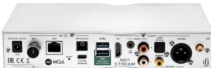
Left Around the back, the NEO Stream's remarkable array of connectivity options adds to its versatility