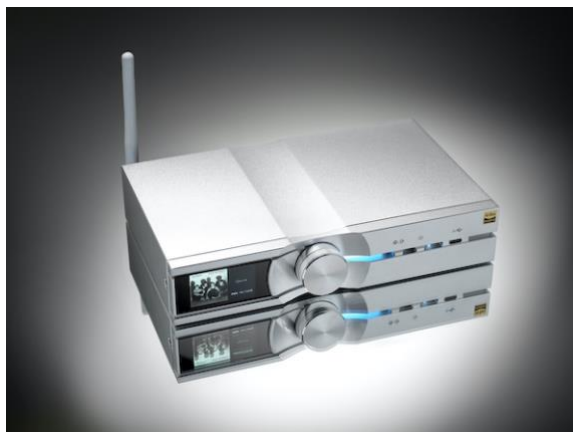
Left The NEO Stream's neat, compact form belies the sophistication of its purpose-built, high-performance circuitry and versatile design

The NEO Stream's desktop-size chassis and aluminium casework clearly resembles the NEO iDSD. But while its circuitry builds on existing iFi designs, its internal architecture and attendant attributes are unlike anything else on the market. This is a new kind of music streamer, built by passionate enthusiasts, expressly for passionate enthusiasts.