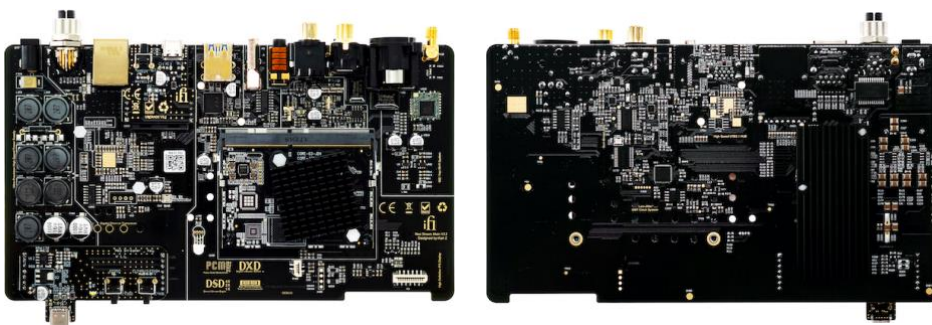
Left The NEO Stream's dual-sided circuit board combines advanced ICs, discrete audiophile-grade components and specially designed low-profile heatsinks

All this attention to detail contributes to the NEO Stream's pure, distortion-free performance. To the ear, this translates as more clarity and texture, and a more dynamic and engaging performance – quite simply, you hear more of the music, just as the artist intended.