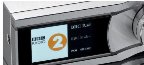
Left Stream albums, radio stations and more via your favourite platforms, in every possible format and resolution