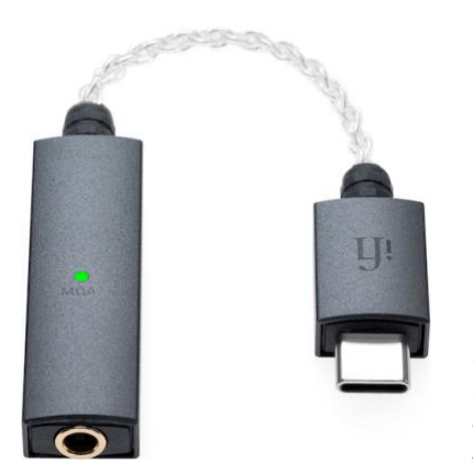
Left With its flexible cable linking the USB-C connector to the DAC/headphone amp, the GO link is a practical solution for great sound with corded headphones

iFi has taken full advantage of the DAC chip's advanced specification, unlocking high-end features such as DRE (Dynamic Range Enhancement), plus technologies to minimise THD (Total Harmonic Distortion) and crosstalk. Users can even select between different digital filters via downloadable firmware should they wish to do so, giving a degree of personal sonic tailoring according to taste.