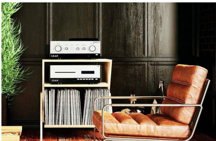
Left, The LEAK CDT CD transport is the perfect CD-spinning companion for the Stereo 230 integrated amp, both seen here without their optional walnut wood enclosures

Much effort has gone into the physical layout of the Stereo 230's circuitry, protecting the sensitive preamp section from noise interference. This, plus the use of independent low-noise power supplies for all critical stages, helps the amp to excel sonically across a range of digital and analogue sources.