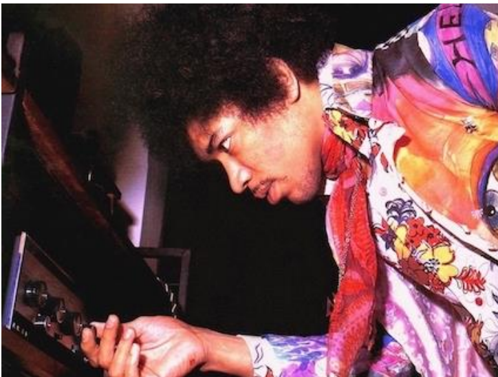
Left Jimi Hendrix turns up the volume on his LEAK Stereo 30 hi-fi amplifier in the late 1960s

Although thoroughly modernised internally, the current LEAK Stereo 130's wood-clad external design is based on another LEAK classic – the Stereo 30 integrated amplifier, which was the first commercially available all-transistor amplifier upon its arrival in 1963. This groundbreaking amp was famously owned by Jimi Hendrix, among other '60s luminaries.