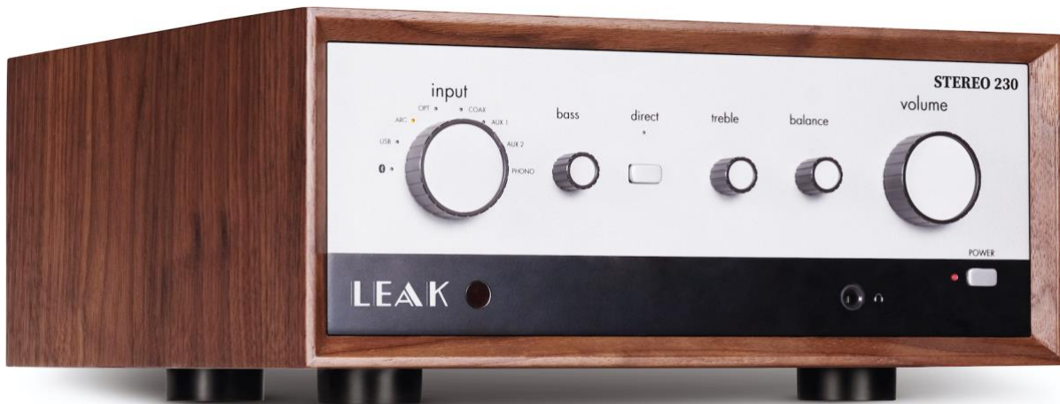
Above LEAK Stereo 230 integrated amp with optional walnut wood enclosure