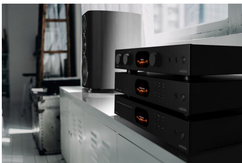
Left All three 7000 Series components are available in classic Audiolab black as well as silver

Finally, 'Pre Mode' disables the power amp stage, turning the 7000A into a standalone DAC/preamp. This enables external power amplification to be added, thus providing a possible upgrade path.