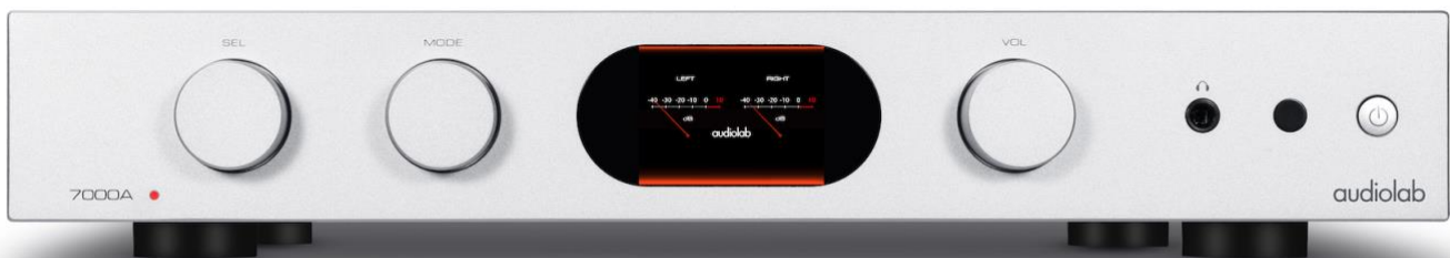
Above Audiolab 7000A in silver finish