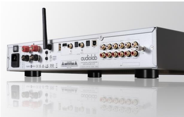
Left The 7000A's USB, HDMI, optical and coaxial digital inputs benefit from the amp's state-of-the-art built-in DAC

The 7000A's hi-res audio support is state-of-the-art, handling PCM to 32-bit/768kHz and DSD to 22.5792MHz (DSD512) via USB. The 6000A, in comparison, is limited to 24-bit/192kHz PCM over S/PDIF (optical and coaxial).