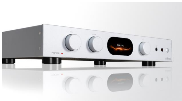
Left Whether powering speakers or headphones, the 7000A is expertly engineered to make the most of all manner of music

The 6000A delivers 50W per channel into 8 ohms; the 7000A ramps this up to 70W, with a maximum current delivery of 9 Amps into difficult loads. The output stage of the discrete power amp circuits uses a CFB (Complementary Feedback) topology, ensuring superior linearity and excellent thermal stability, as the idle current is kept independent of the temperature of the output transistors. The 6000A's 200VA toroidal transformer has been updated to a new 250VA unit, combining with 60000uF reservoir capacitance to maintain firm control of the music whilst enabling excellent dynamic range.