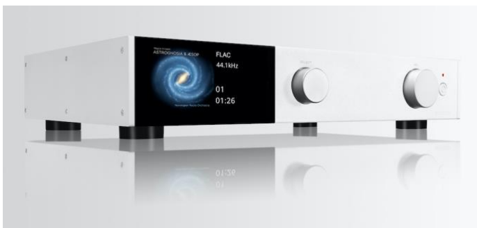
Left The 9000N's leading-edge streaming technology delivers sonic excellence and a consummate user experience

The 9000N's main control app provides quick, easy access to fully integrated services such as Tidal, Qobuz, Spotify and TuneIn Radio, with a superbly intuitive yet feature-rich interface that makes browsing a pleasure. Intelligent search functions and the ability to create multi-source playlists, group albums and organise folders create a personalised experience that allows the user to discover, sort and play their music however they prefer.