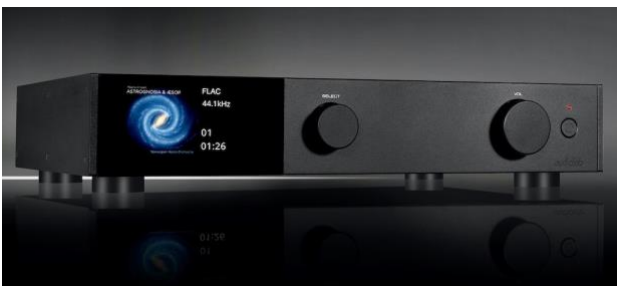
Left Available in black as well as silver, the 9000N benefits from Audiolab's longstanding experience in developing circuitry around ESS Technology's Sabre DACs

Since then, Audiolab devices have featured successive generations of Sabre chips, culminating here with the ES9038PRO – a preeminent DAC from the top tier of ESS Technology's current range. The DAC's eight channels are fully utilised in stereo configuration – four for the left channel, four for the right – to eradicate noise and distortion, accompanied by proprietary Audiolab circuitry including an ultra-precision master clock. This makes the most of the chip's HyperStream II architecture and Time Domain Jitter Eliminator, delivering a remarkable signal-to-noise ratio and exceptional dynamic range.