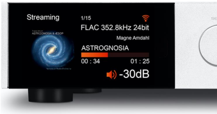
Left With a wealth of information and options available, the 9000N's display can be configured as the listener prefers

The same screen graces the 9000A and 9000CDT, but it really comes into its own with the 9000N thanks to its ability to display full-colour album artwork. A wealth of data is available to the listener, including the presently engaged streaming service, playlist position, network type, file format, bit depth/sample rate, artist name, album and track title, time elapsed/remaining and volume level – with various options to select which information is displayed and how it appears on screen.