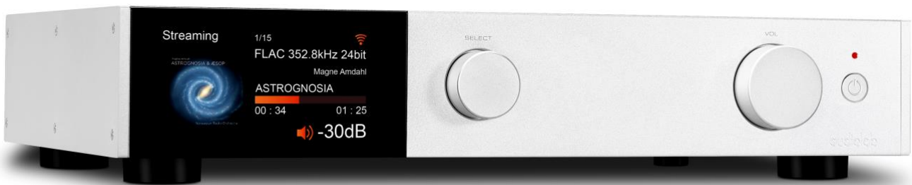
Above Audiolab 9000N in silver finish