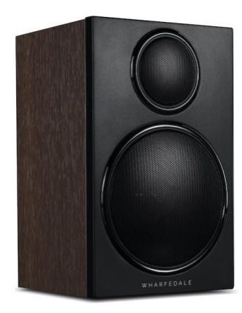
Left The diminutive DX-3's fixed speaker grilles protect the drive units without obscuring their shape or covering the front baffle

The new 5.1 home cinema pack, the DX-3 HCP, combines two pairs of DX-3 speakers for the front and rear channels with the DX-3 Centre and DX-3 Subwoofer, at an RRP of £499. Additional pairs of DX-3 speakers can be added if required, for systems that extend the number of surround sound channels beyond 5.1.