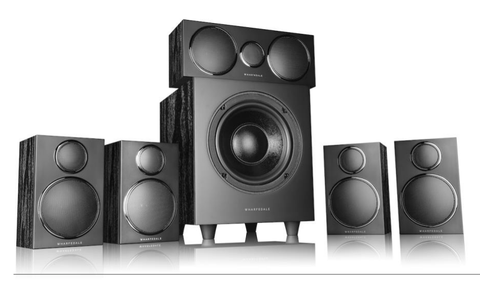
Above Wharfedale's DX-3 compact speaker forms the heart of the DX-3 HCP home cinema speaker pack