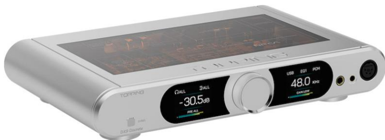
Left Curved edges, twin displays and a glass top – the DX9 Discrete looks and feels every inch a premium product

The DX9 Discrete's classy look and feel is further complemented by a neat remote control, housed in a unibody, CNC-machined, high-density aluminium chassis with a fine sand-blasted finish.