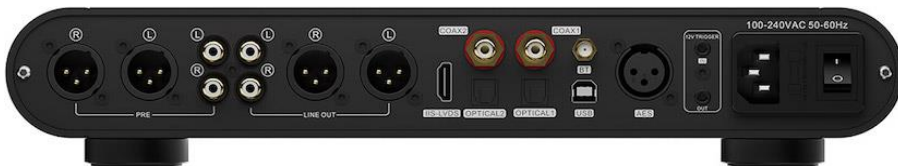
Left An array of digital input and analogue output options provide plenty of flexibility

Analogue output options are plentiful. For headphones, there are balanced outputs in 4.4mm and 4-pin XLR form, together with a single-ended 6.35mm socket. For amps and speakers, there are balanced XLR and single-ended RCA sockets labelled 'pre', and the same again labelled 'line out'. The former incorporates the volume control to feed a power amp or active speakers, while the latter delivers a fixed line-level output to connect to an integrated amp or preamp.