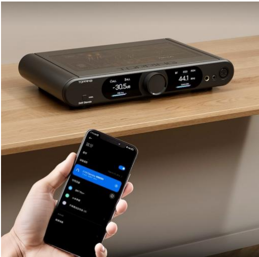
Left Technically innovative and eminently versatile with exceptional sonic ability, the DX9 Discrete is a remarkable DAC/headphone amp