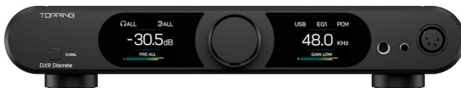
Left Digital audio is treated with utmost care prior to conversion to analogue

Topping has included the convenience of device-to-device streaming via Bluetooth too. A comprehensive suite of high-definition Bluetooth codecs is supported, including LDAC and aptX Adaptive up to their maximum 24-bit/96kHz specifications, as well as aptX HD.